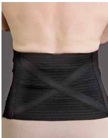
X-brace design for stability